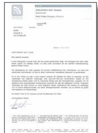
Example of an unofficial exhibitor directory of the International Fairs Directory

The official Messe Frankfurt publications