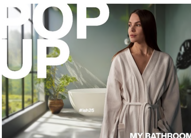
Human Scale: People are the bathroom-planning benchmark. It is the everyday activities and the special moments, the time-outs, the physical

This year, the focus at Pop up my Bathroom is firmly on people with presentations designed to make trade-fair visitors aware of how much the needs of users are an integral part of bathroom planning. Bathroom products, walls and floors, technology, a wide range of materials and colours, light, sustainability and the bathing experience are the key elements of modern bathroom planning. Nevertheless, if user needs are not prioritised, the bathroom remains a purely functional space without a soul. It is the everyday routines and special moments, the time-outs, the physical experience and the daily rituals that make the bathroom a genuine living space. Therefore, the bathroom is transformed into a stage at Pop up my Bathroom 2025.