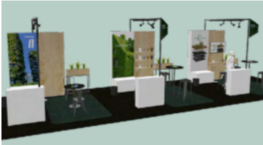
Exemplary layout / design

All-inclusive price: complete package including stand space, stand construction and equipment, media package, environmental contribution, plus AUMA fee and VAT